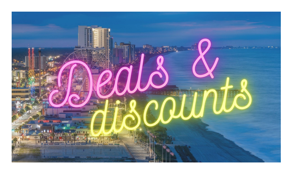
Planning for Fire-Rescue: Deals and

We're humbled by the opportunity to serve South Carolina firefighters day in and day out. You're pillars in your community, active community servants, role models for the next generation, and that's just scratching the surface. You willingly risk your life and sacrifice time with your family to be in the fire service. Your contributions are significant and make your community a better place to live and work. Thank you for what you do. Happy International Firefighters Day!