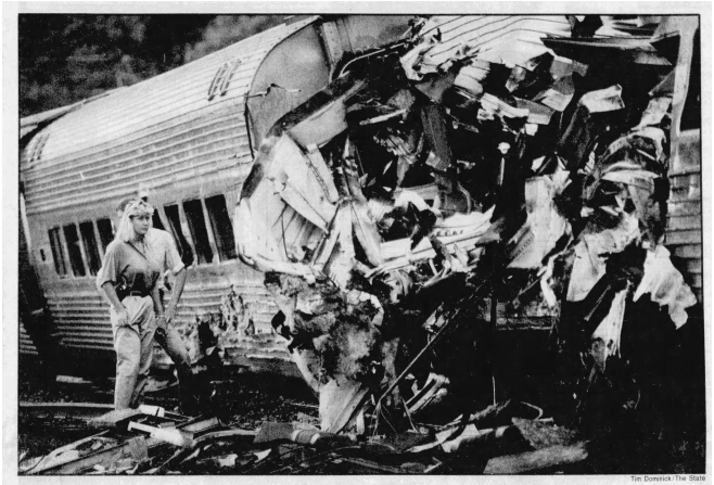
Rescue workers stand near damaged cars of Amtrak's Silver Star passenger train after it derailed Wednesday.

someone stole his tools at the plant. Peoples pleaded guilty and was sentenced to 10 years in prison.